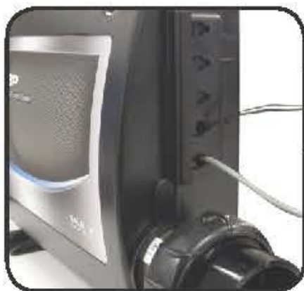
SYSTEM SIDE VIEW

After the Gateway Ultra Spa module is inserted, gently pull on the wire to make sure the clip is securely in place and will not come lose.